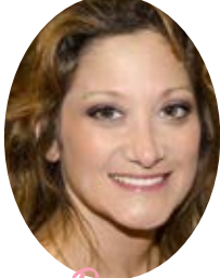
Dawn MacFlip Unit