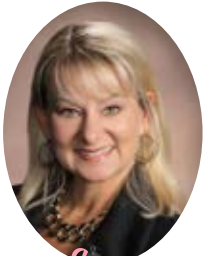
Susan Shaw Unit