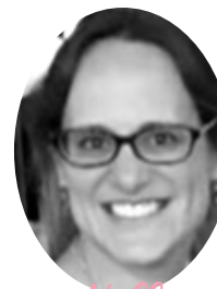
Kelly Nichols Unit