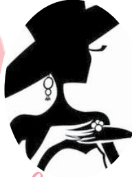
Courtney King Unit