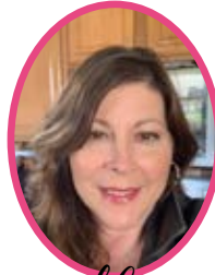
Libra MacFlip Unit