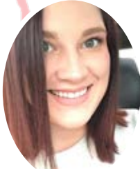
Casie Ewing Unit