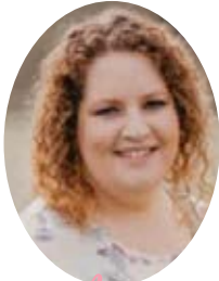
Anna Burnett Unit