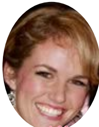
Alli Lauchlan Unit