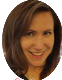
Catherine King Unit