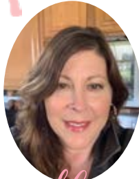
Libra MacFlip Unit