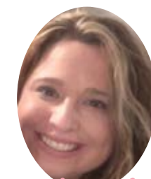
Amanda Shaw Unit