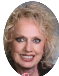
Dawn Shaw Unit