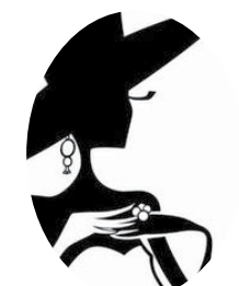
Tiffany Barts Unit