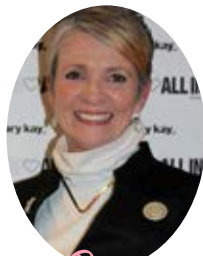
Diane Stanley Unit