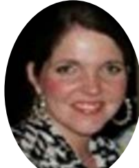
Anecia Erbe Unit