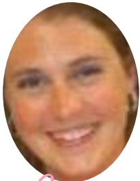
Joanna Burnett Unit