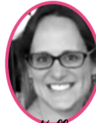
Kelly Nichols Unit