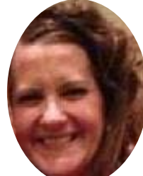
Nicole Burnett Unit