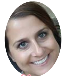
Chrissy Nichols Unit