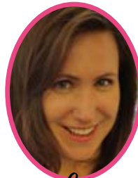
Cat King Unit