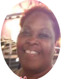
Venus Pratt Unit