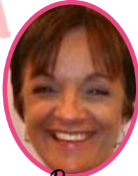
Dawn Aucker Unit