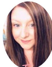
Tina Arbuckle Unit