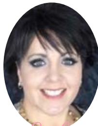
Barbie Shaw Unit