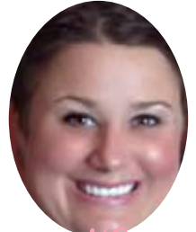
KJ Barts Unit