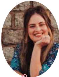
Grace Peyton Unit