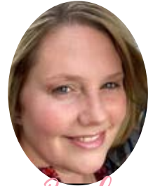
Brooke Hottle Unit