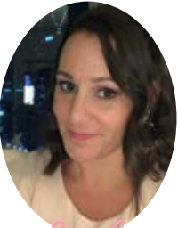
Sandra Stanley Unit