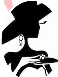
Tracy Howard Unit