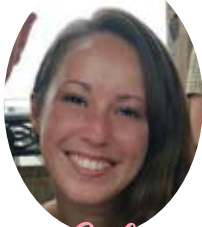
Julie Webster Unit