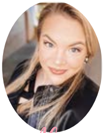
Alicia Underwood Unit