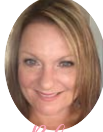
Rebecca Shaw Unit