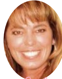
Judy Hutchinson Unit