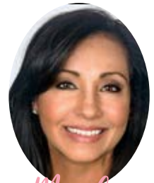
Marilyn MacFlip Unit