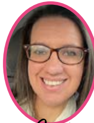
Janet Howard Unit