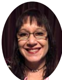
Lynda Shaw Unit