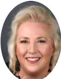
Laurie MacFlip Unit