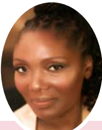
Tannilia Samuels Unit