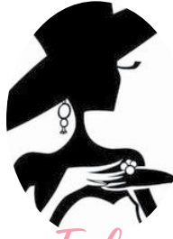
Taylor Ewing Unit