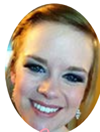
Janie Raley Unit