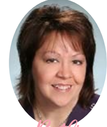
Ruthie Shaw Unit