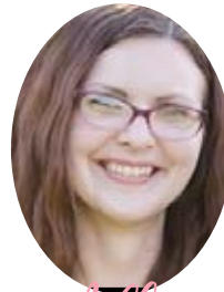
Ashley Hicks Unit