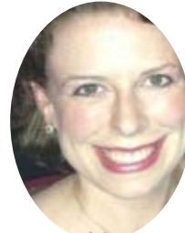
Kim Arbuckle Unit