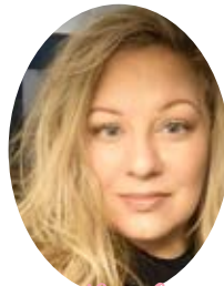
Paula Lauchlan Unit