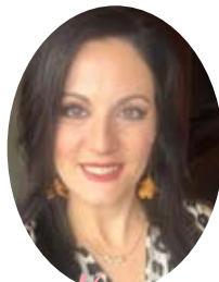
Karen Shaw Unit